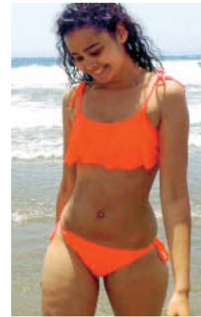
Saffron before surgery